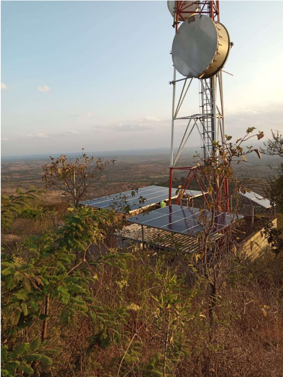
Solar Battery Diesel Hybrid – 11 Stations for Eaton Towers on behalf of Autarsys E.A