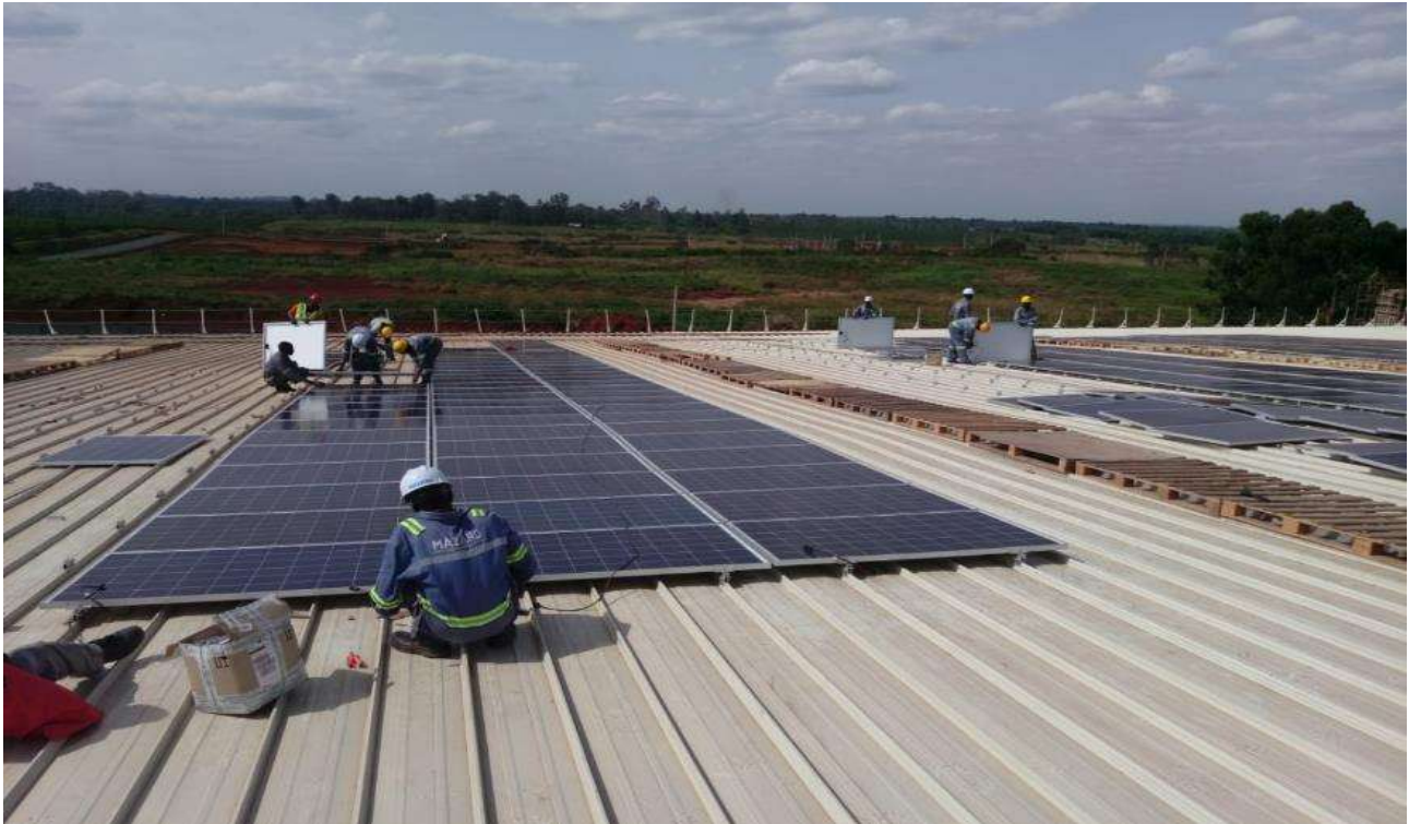
Ruiru, Kiambu – 303 kWp + 202 kWp Rooftop System