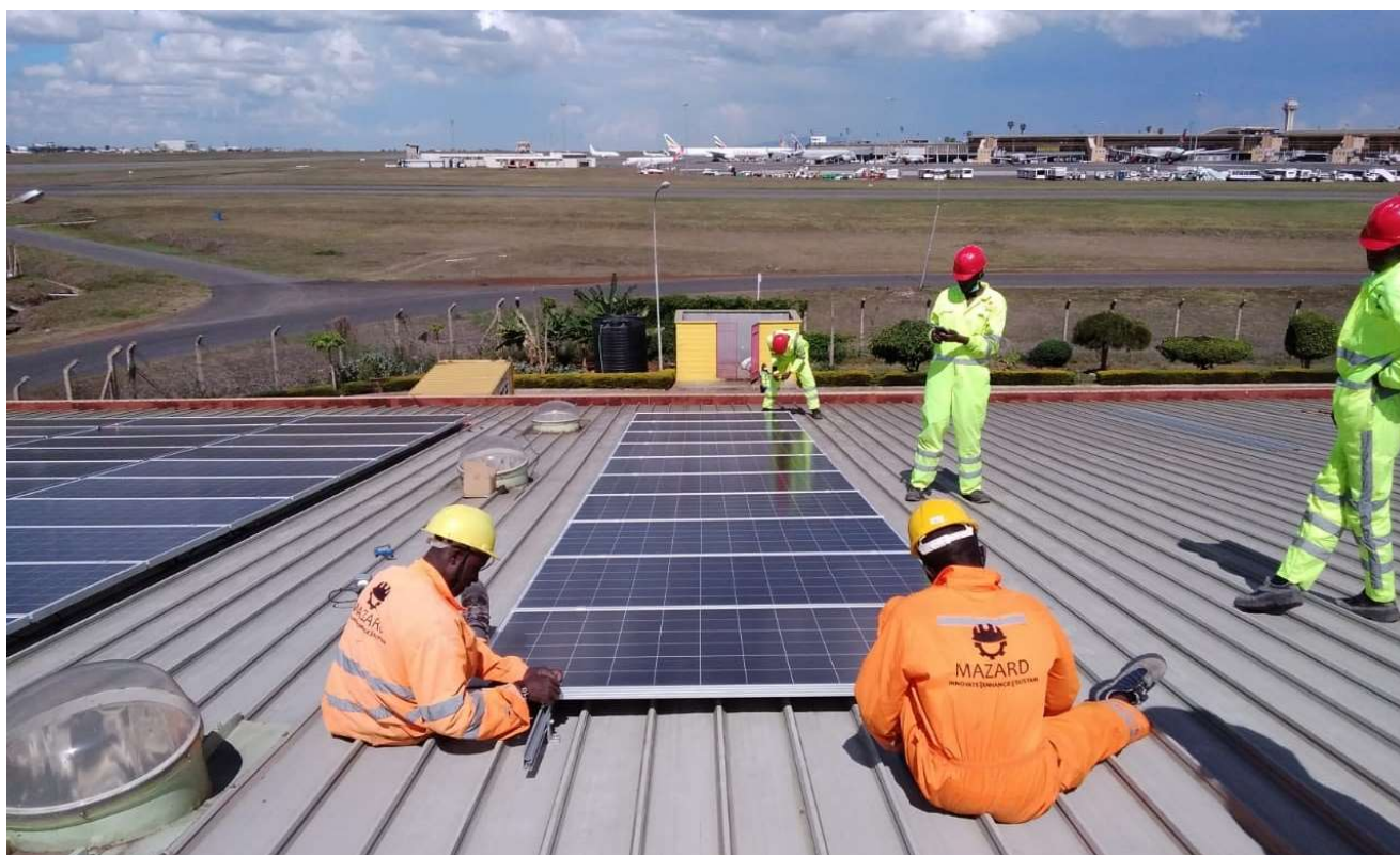
JKIA, Nairobi – 35 kWp Rooftop System