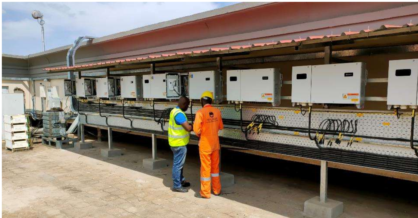
Karen, Nairobi – 563 kWp Rooftop System