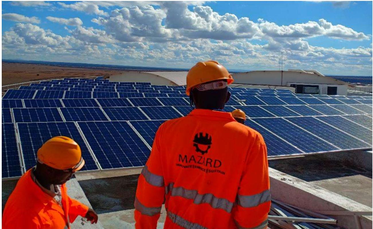
Konza City, Kajiado – 80 kWp Concrete Roof System