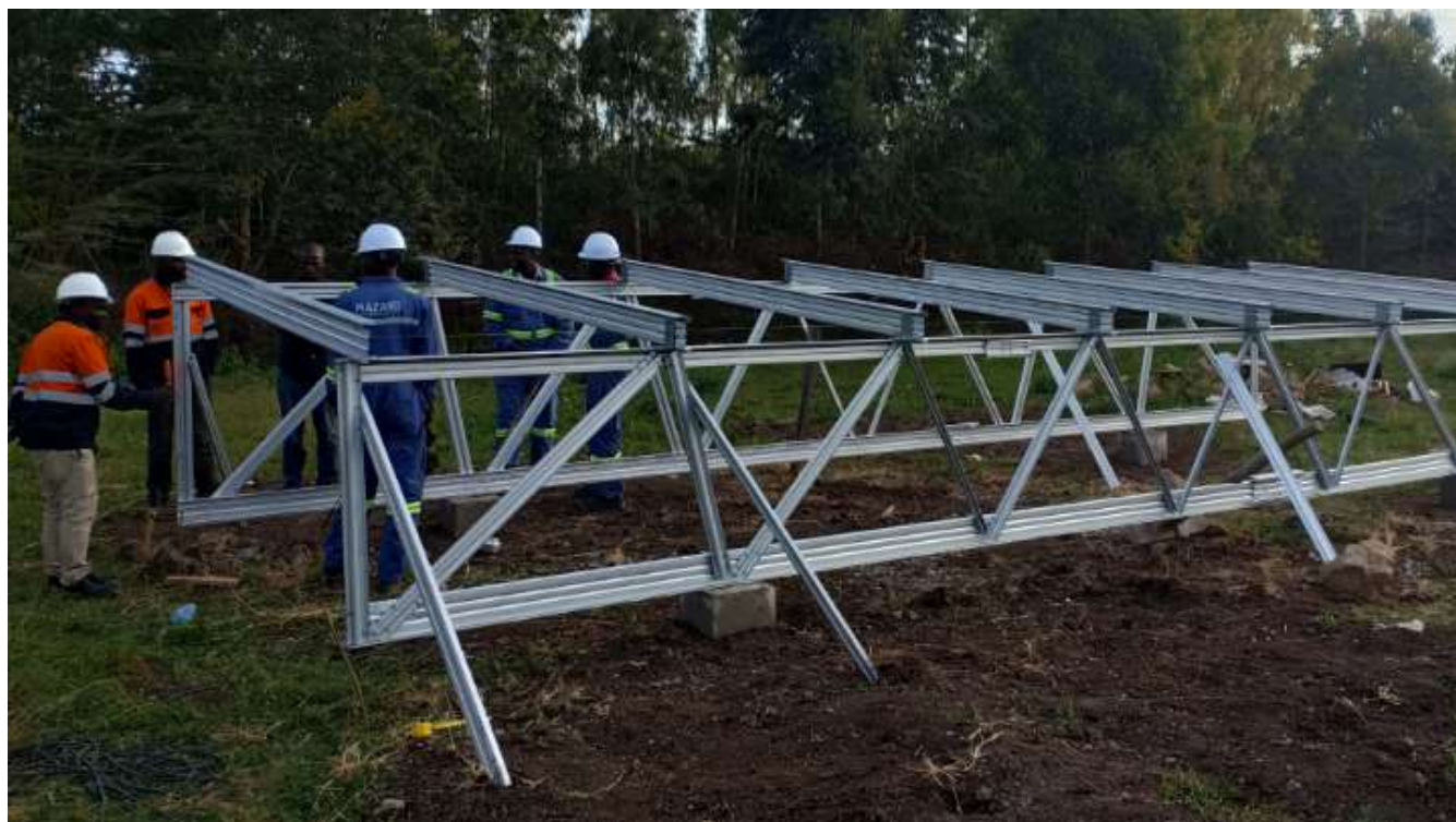
Isinya, Kajiado – 300 kWp Ground Mount System