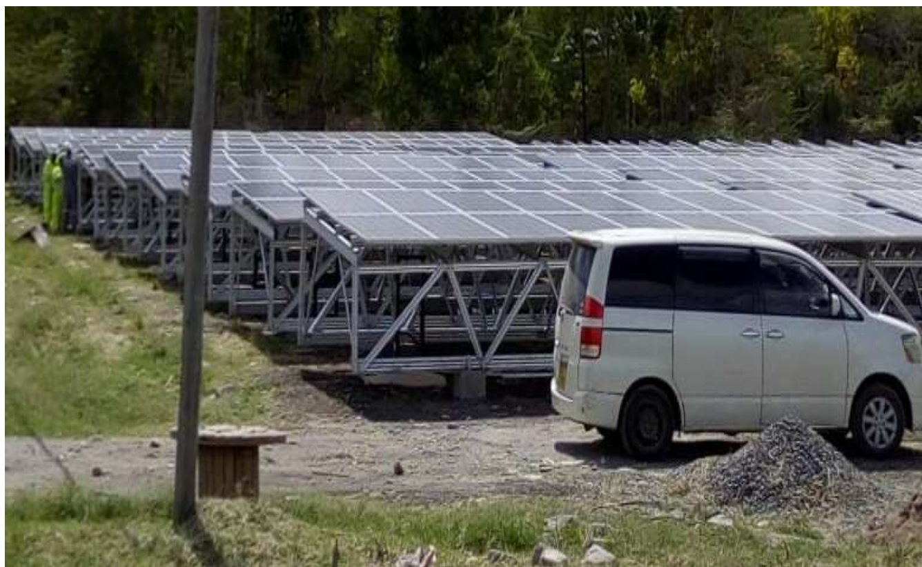
Isinya, Kajiado – 300 kWp Ground Mount System