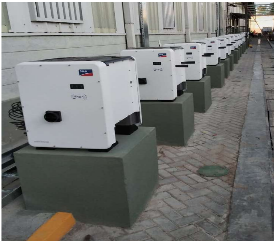
Athiriver – 10004 kWp Roof Mount System