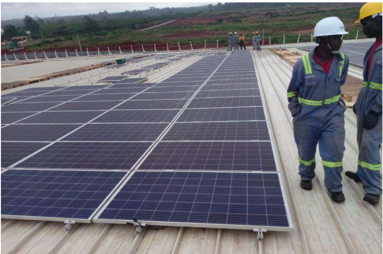
Ruiru, Kiambu – 303 kWp + 202 kWp Rooftop System