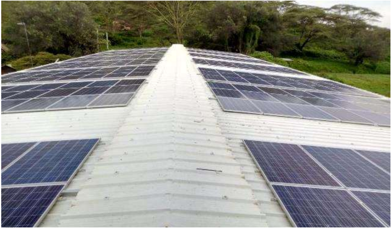
Naivasha – 186 kWp Rooftop System