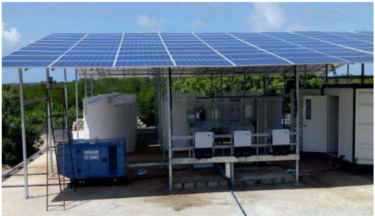
Kiunga, Lamu – 50 kWp Canopy Rooftop System