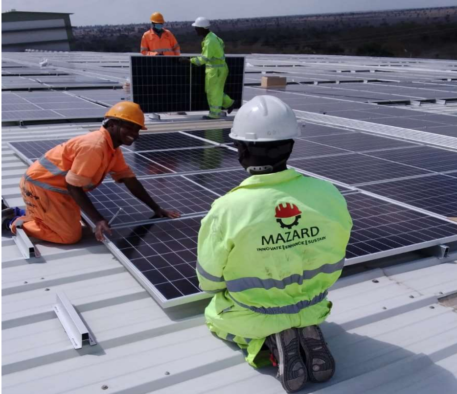
Athiriver – 10004 kWp Roof Mount System