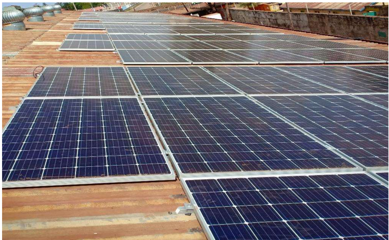
Juja, Kiambu – 36.7 kWp Roof Mount System