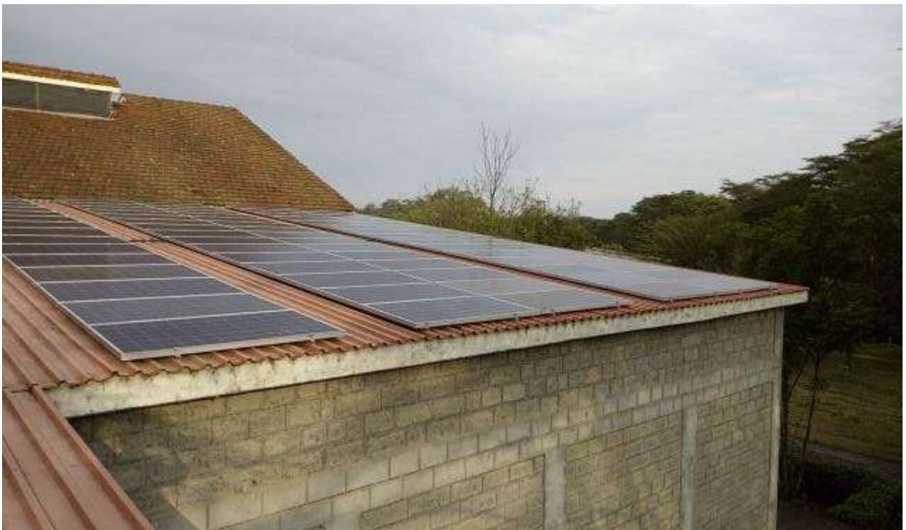
Naivasha – 186 kWp Rooftop System