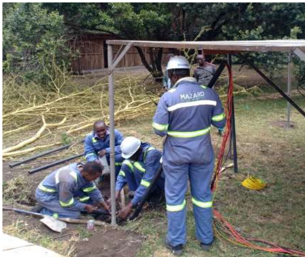
Masai Mara – 5kWp Solar Battery Diesel System