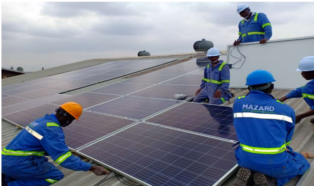
Mombasa Rd – 24 kWp Rooftop System