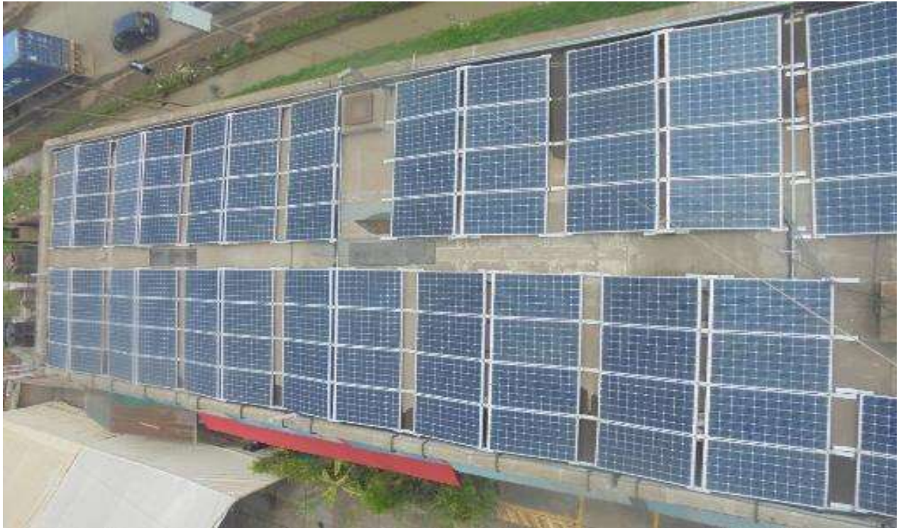
Industrial Area, Nairobi – 30 kWp Ballast Rooftop System